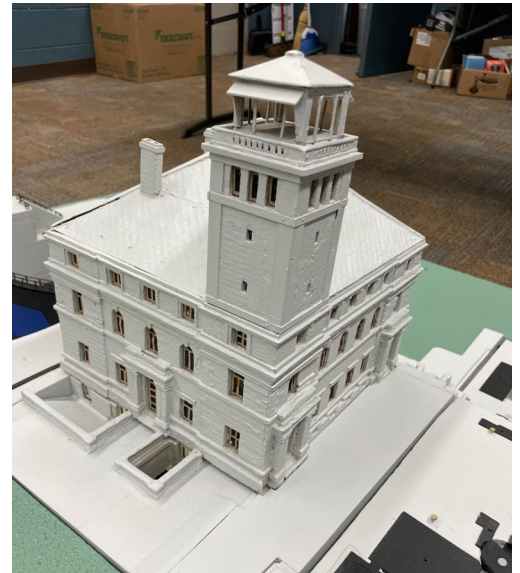
Restored part of 1893 model.

First off – we want to thank all our donors for their support of this project and their patience. This was a huge and complex project and as such, it experienced a few hiccups. Supply chain issues and price changes lead to several delays with contracts modifications and allocation of additional funds to keep the project moving. The departure of the primary points of contact for both USACE the contractor for new positions lead to further delays with no one in place to push the project along.