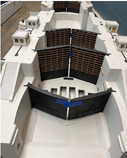
Lower operating gates of 1912 model.

Though progress slowed, the project did not stop. The Soo Locks Visitor Center Association used the surplus funds it raised to take on the cost of restoring the historic models. Meanwhile USACE worked through its process and eventually got the project moving and on track for installation this year.