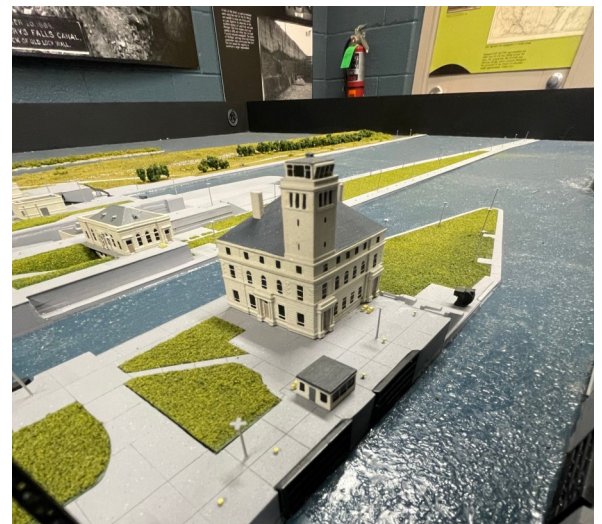
The Admin Building in the new model.

We plan to complete the final piece of the project on June 26, 2025, the day before Engineers Day, with a celebration, officially naming the area “Soo Locks Plaza” and recognizing the many donors that made the project possible. We hope you can join us.