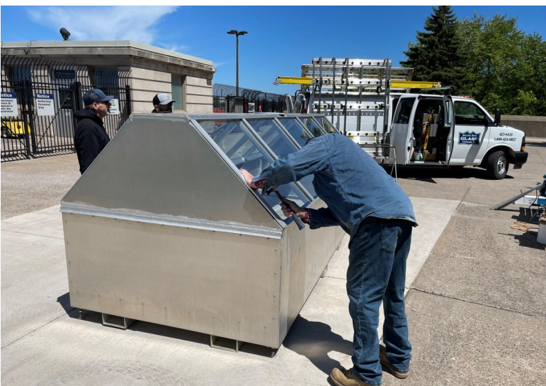
Workmen install glass in the first of three new model cases.

Thank you again for your support and patience and we hope to have more photos to share in the months ahead!